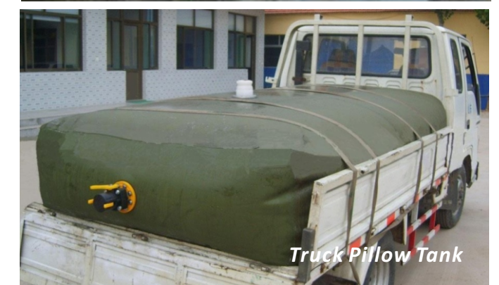
Truck Pillow Tank